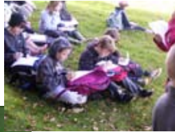
Learning Outside the Classroom