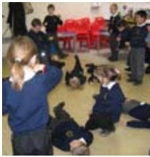
High Weald Drama Workshops

Get in touch with us if you'd like to find out more about how you can get involved in any of the free or subsidised opportunities featured below.