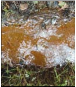
Iron in water