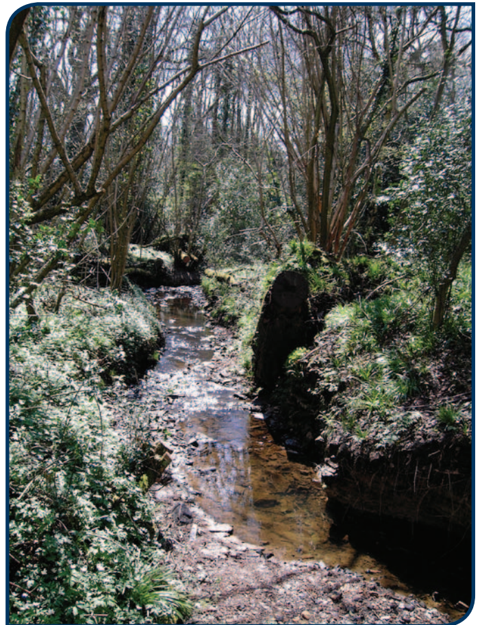
Crossing the stream in a wooded valley