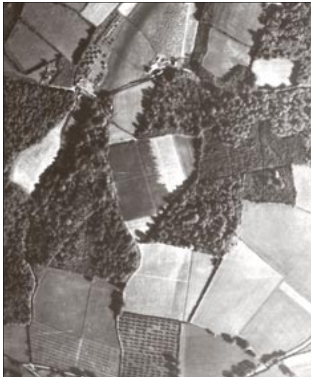
Looking down on Lamberhurst in the 1940s