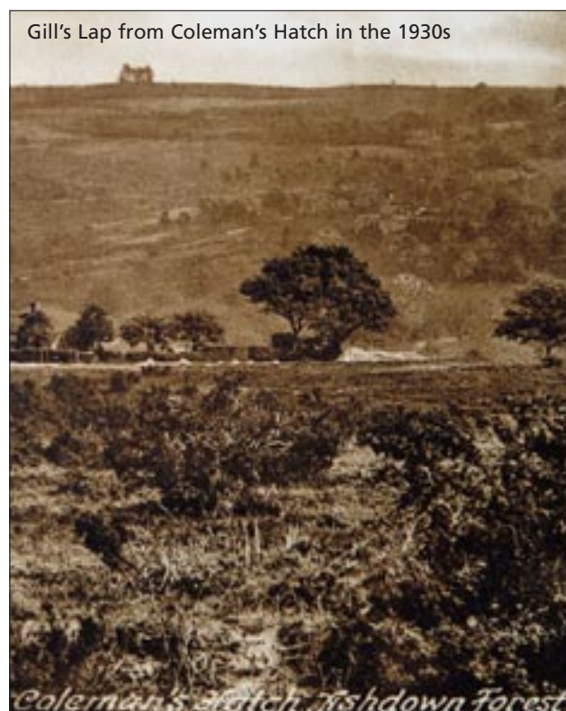
Gill's Lap from Coleman's Hatch in the 1930s

The crux of the matter is that if we want to make the most of the resources that the landscape provides there needs to be a viable market for whatever is being produced. To that end all of us play a part in the future of our rural landscape every time we make a choice about where to buy our logs or our meat for the Sunday roast.