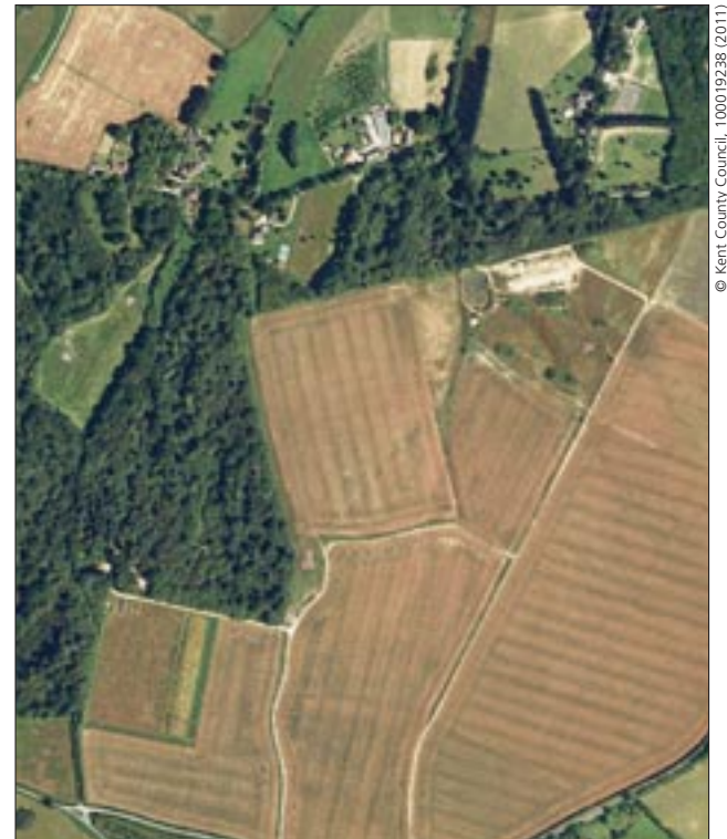
...and in 2008

As we say farewell to the first decade of a new millennium, what does the future hold for the High Weald? The character of the landscape is essentially the same as it was 600 years ago; it is considered to be one of the best preserved medieval landscapes in Northern Europe. But will its special character be evident 600 years from now? Or will the pressures of a growing and globalised society prove too much?